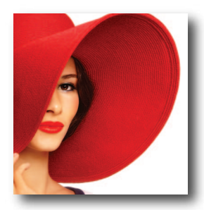
RED HAT SOCIETY My Life in a Bag Friday, March 25 | 3:00 pm Sip on Afternoon Tean with the ladies of the

Sip on Afternoon Tean with the ladies of the Red Hat Society while sharing life stories before arriving at Melrose Gardens.