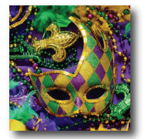
MARDI GRAS PARTY And Second Line Tuesday, March 1 I 3:00 pm

Join us for one last, hedonistic hurrah before the Lenten season begins. Laissez les bon temps rouler!!!